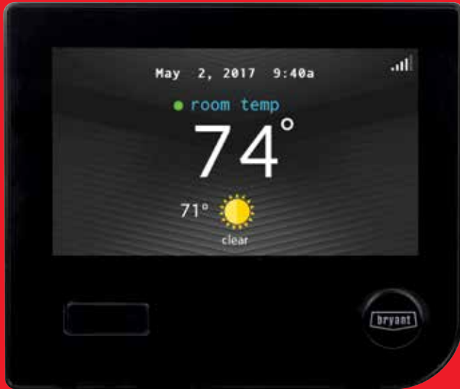
Evolution® Connex™ Control

The Evolution® Connex™ control puts you in command of your comfort when you want it, where you want it and how you want it.